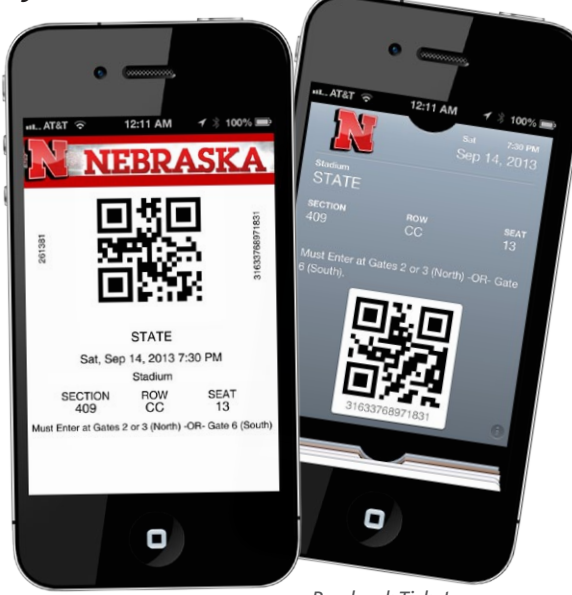
Mobile PDF Ticket

event. This provides heightened security by identifying counterfeit and stolen tickets.